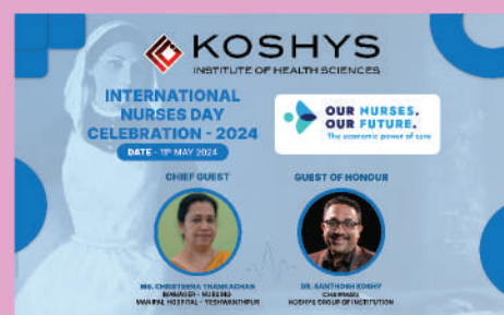
International Nurses Day