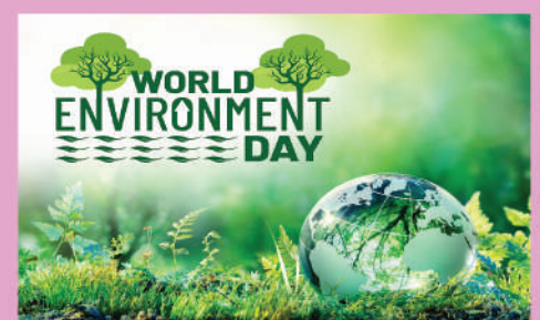
World Environment Day